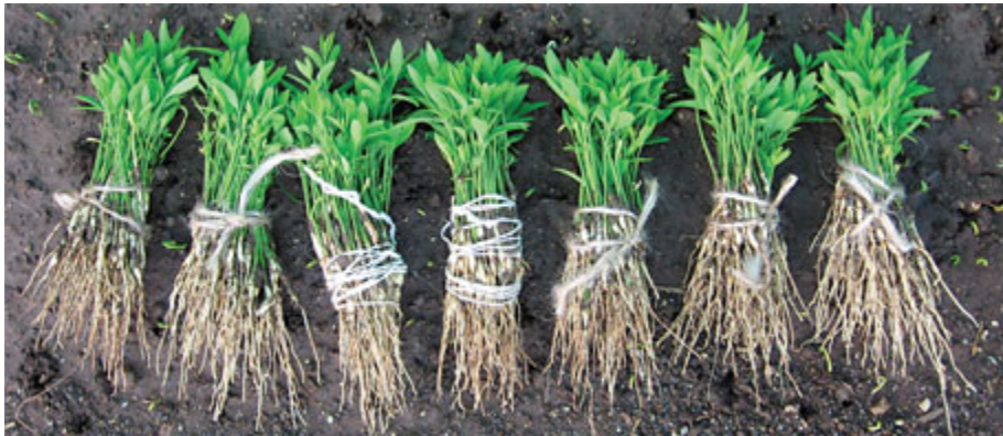
Seedlings will mature and become ready for harvest in 15-20 years

Despite a growth in cultivation, it will be difficult for India to regain its leadership position in global sandalwood trade anytime soon. In fact, growers are unable to meet the domestic demand.